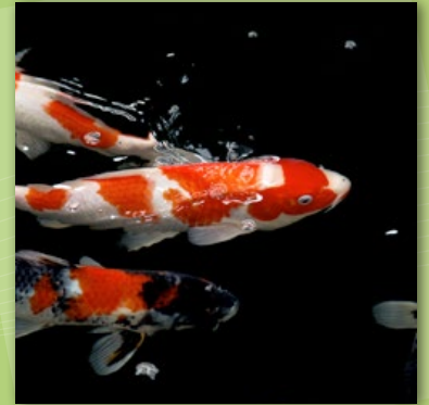
in fish farms