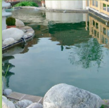
in fish ponds